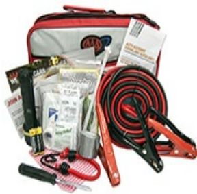
Vehicle Emergency Kit