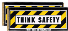
Think Safety Chocolate Bars