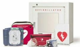
Philips Heartstart Onsite AED