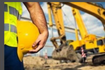
Excavation Safety Stand-