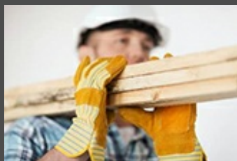
Revised Construction Statistics