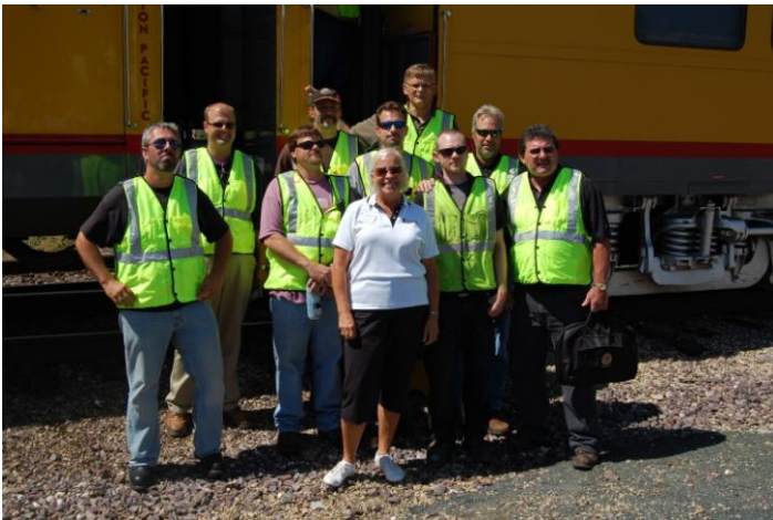
MNOL Executive Director with Union Pacific Operation Lifesaver Safety Train Crew.